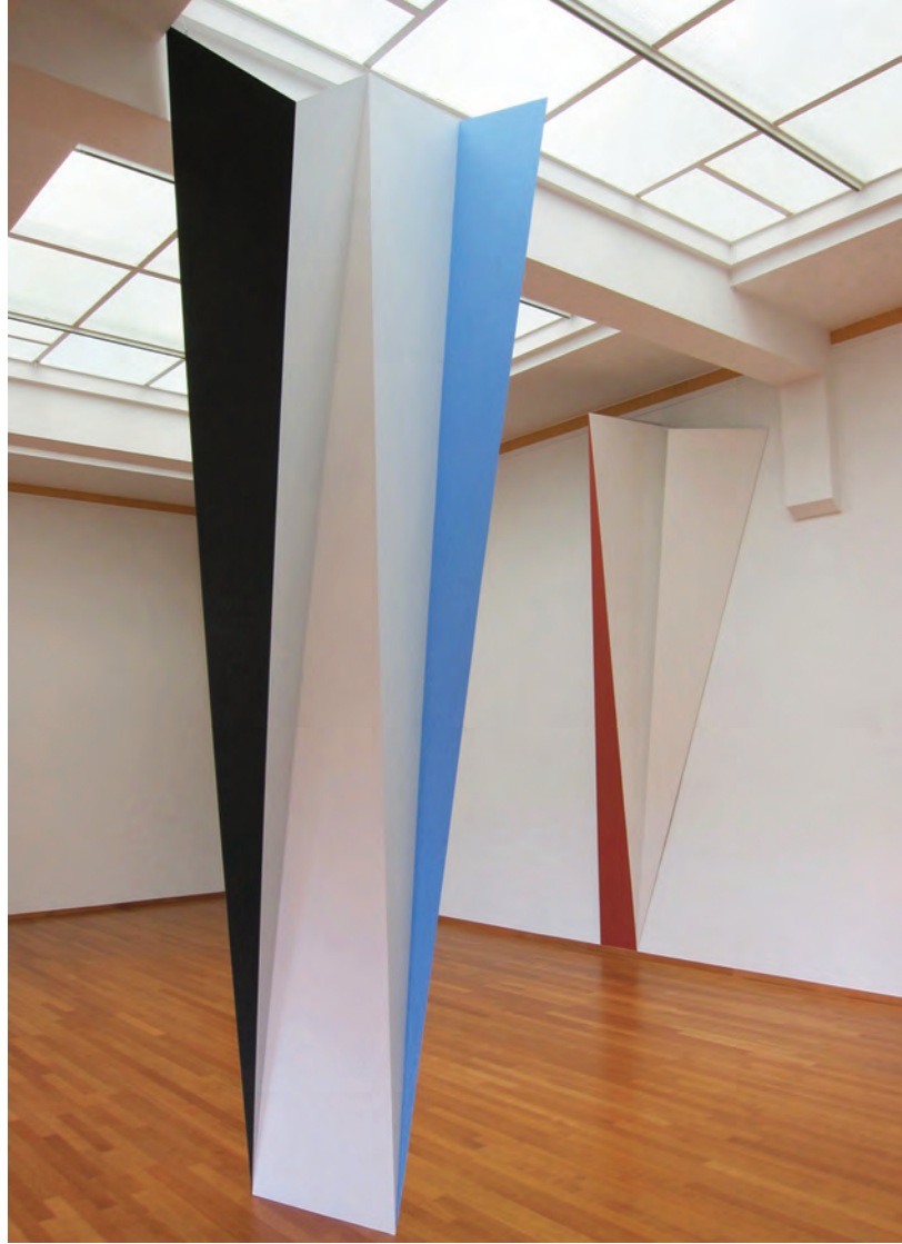
FORGOTTEN WHAT I HAVE SEEN April 2013 Gesso, Acrylics on Mdf 460 x 135 x 135