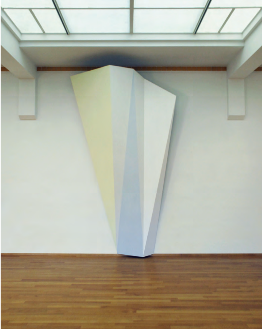
THE NEW April 2013 427 x 200 x 85 Gesso, acrylics on Mdf