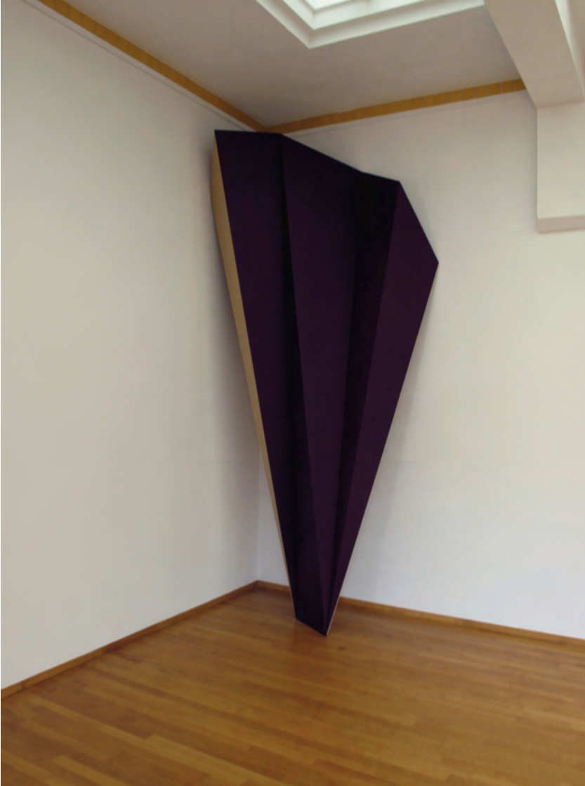
LISTEN April 2013 427 x 185 x 60 Gesso, Acrylics on Mdf