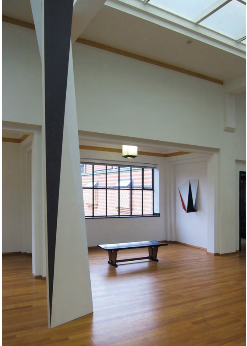
Untitled, 2012 acrylic and oil on MDF 140 x 88 x 38 cm