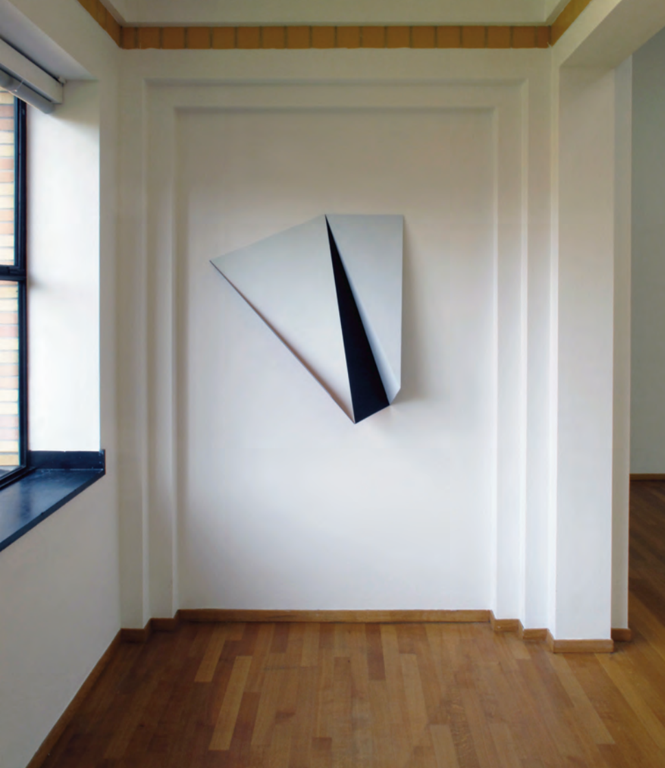
UNTITLED 2012 acrylic and oil on MDF 140 x 88 x 38